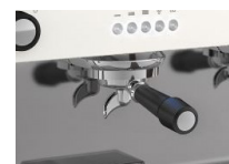
TA (Take Away)/High Group

Crem EX3 is an attractive and extremely versatile professional espresso machine. Featuring a smart design concept it can be easily customized, and manufactured through the combination of numerous different options , both external (number of groups, colours and finishings, lighting, etc.) and technical. Thus, the EX3 is aimed to suit any kind of business with an espresso demand, whatever it is an independent or a national coffee shop chain.