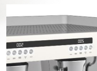
Display (PID controlled)