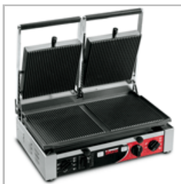
PD R Timer