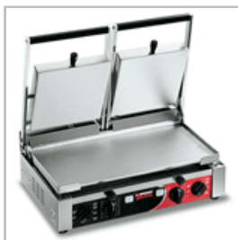
PD XX Timer