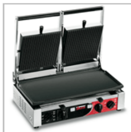
PD L Timer