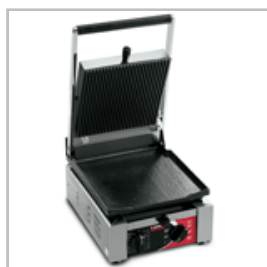
ELIO L Timer