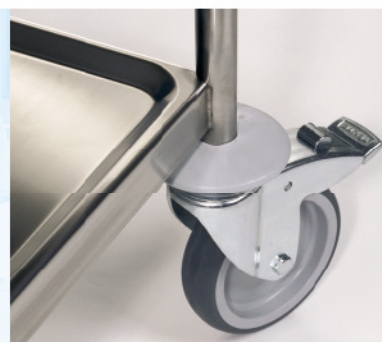
The corners of the shelf are curved to make them easy to clean.