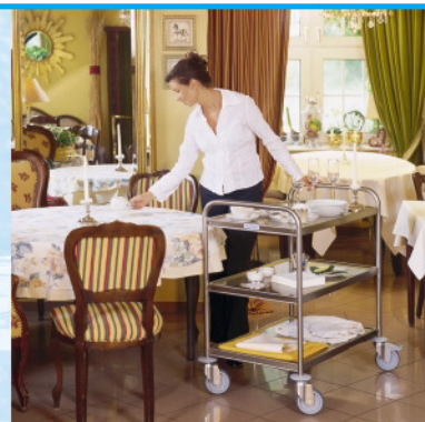
Serving trolley Standard SW 8 x 5/3, fitted with 3 shelves 800 x 500 mm.