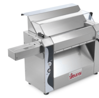
Sansone 42 with optional pasta cutter