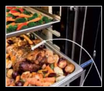
Core temperature probe.

Find the future with the USB-compatible touch screen model – the perfect high-tech solution for menu consistency. With uploading and downloading of product menu programs, you can easily keep multiple units up to date with menu changes.