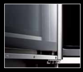
Stay cool vented door.

With the optional Core Temperature Probe fast, concise readings can be taken and faultless outcomes expected. It's this peace of mind that can make such a difference when you've got more things to do than hours in the day.