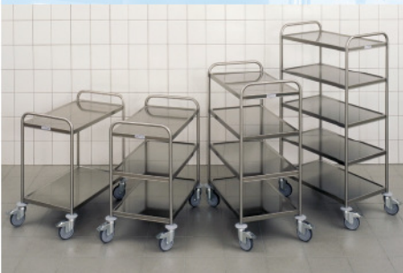
Pictured above: Serving trolley Standard SW 6 x 4/2, fitted with 2 shelves 600 x 400 mm.