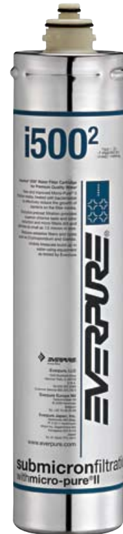
i500 Replacement Cartridge: EV9612-24

Everpure water treatment systems (excluding replaceable elements) are covered by a limited warranty against defects in material and workmanship for a period of five years after date of purchase. Everpure replaceable elements (filter cartridges and water treatment cartridges) are covered by a limited warranty against defects in material and workmanship for a period of one year after date of purchase. See printed warranty for details. Everpure will provide a copy of the warranty upon request.